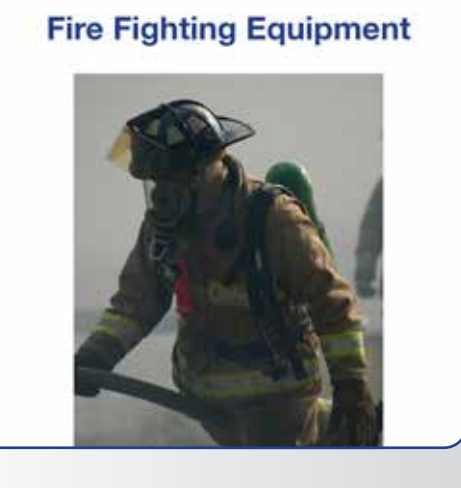
REDA Hazard Control Performance...

Delivering Quality Products and Services in a Timely Manner Based on Your Needs