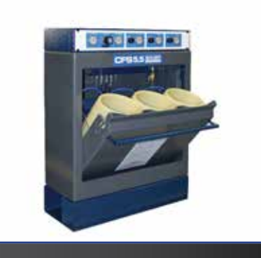
Breathing Air Systems