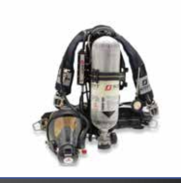
Breathing Air Systems